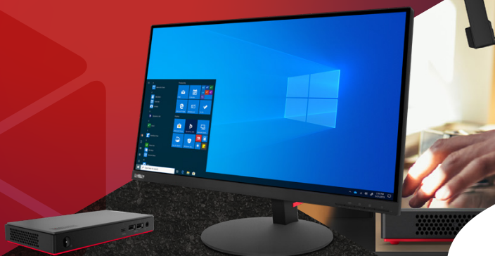
ThinkCentre M90n Nano

It doesn't get much smarter than zero touch