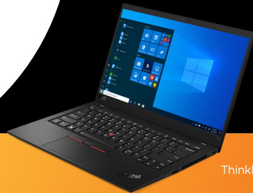
ThinkPad X1 Carbon

of global businesses have introduced a flexible workspace policy or are planning one. 1