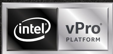
ThinkPad X13 Yoga

Dedicated technical support available 24/7/365