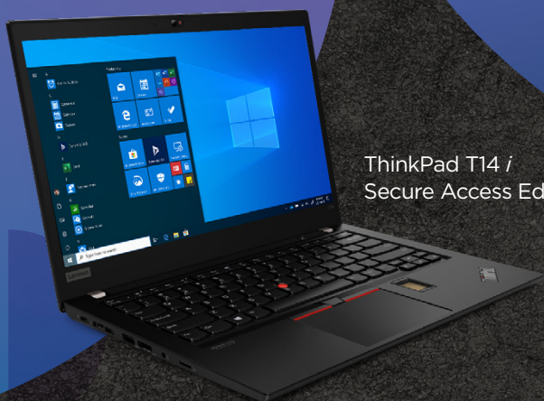
ThinkPad T14 i Secure Access Edition

Persistent endpoint management for real-time monitoring and remediation.