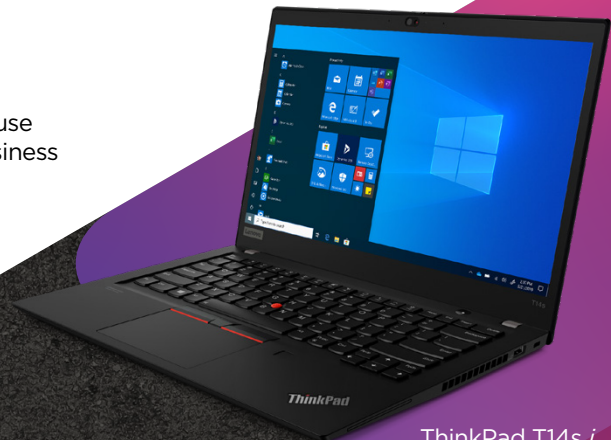
ThinkPad T14s /