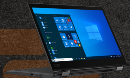
ThinkPad X1 Yoga