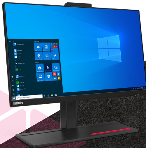
ThinkCentre M90a All-in-One

of IDC survey respondents have or plan to engage in DaaS in the next 12 months to address their IT needs. 20