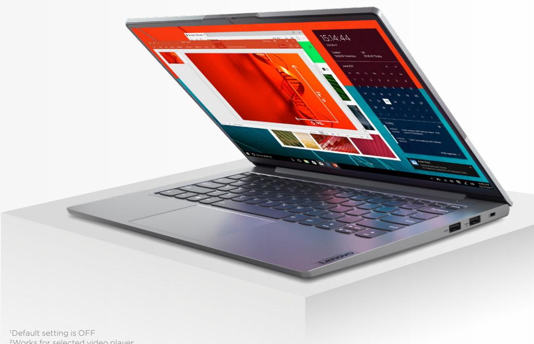
<sup>2</sup>Works for selected video player

Modern Standby: never miss out on anything important, even when the lid is closed. With Modern Standby, you can get email, IMs, call notifications, and even play music, and your laptop does not need to be active.