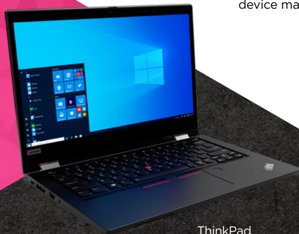
ThinkPad L13 Yoga

Every step of the manufacturing process is controlled, audited, and tamper-proof from our facility to your employees' desks.