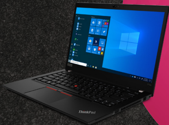
ThinkPad P14s i Mobile Workstation

Technical debt accumulates when you attempt to solve one security issue at a time with solutions that weren't designed to work together. Customizable, end-to-end solutions reduce sunk costs and create new cost efficiencies.