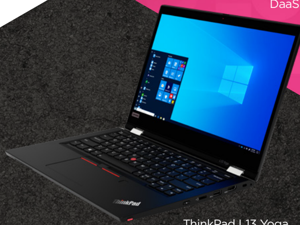
ThinkPad L13 Yoga