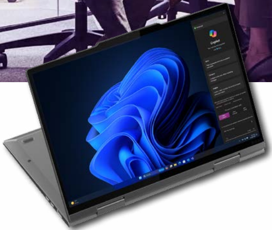
Lenovo ThinkPad X12 in 1 Gen 9

* Timing of feature delivery and availability varies by market and device. Use Copilot with a Microsoft Account or use Copilot with commercial data protection at no additional cost by signing into a work or school account (Microsoft Entra ID) with Microsoft 365 E3, E5, F3, A3 or A5 for faculty, Business Premium, and Business Standard. Coming to more Entra ID users over time.