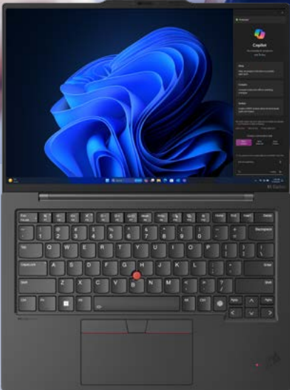
Lenovo ThinkPad X1 Carbon