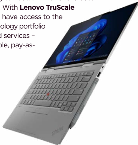
Lenovo ThinkPad X1 2 in 1

No matter where you are in your upgrade/refresh plans, Lenovo makes it easy to equip your entire workforce with the latest devices running Windows 11 Pro for the best possible user experience. With Lenovo TruScale Device as a Service , you have access to the industry's broadest technology portfolio – hardware, software, and services – delivered through a flexible, pay-as-you-go solution.