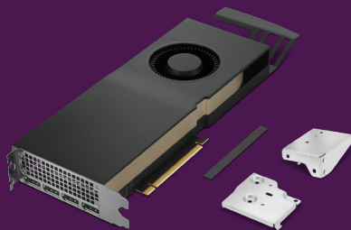
NVIDIA RTX™ A4500 Graphics Card

For a full list of accessories and options, please visit: accsmartfind.lenovo.com