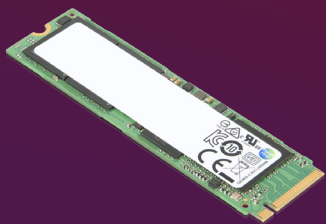
2TB Performance PCIe Gen4 NVMe OPAL2 M.2 2280 SSD