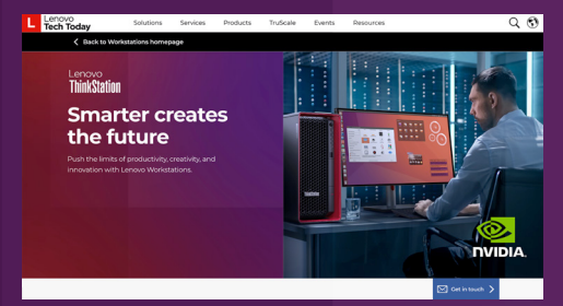
Visit: Tech Today