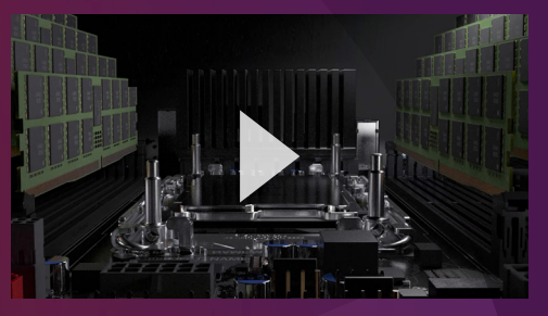
Watch: P7 Feature video