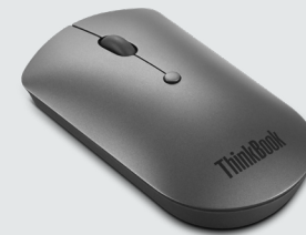
ThinkBook Bluetooth Silent Mouse PN: 4Y50X88824

The Lenovo Go Wireless ANC Headset with Teams Certification is designed to reduce ambient noise and maintain productivity while on the go. The USB-A Bluetooth receiver provides an outstanding connection. With Microsoft Teams Certification and cutting-edge noise cancellation technology, both office and remote workers will have the tools they need to tune out distractions and tune in to their work - all in one headset. This supports dual Bluetooth 5.0 and USB Audio connectivity for multitasking and advanced noise cancellation with ANC & ENC optimizes audio quality and talk-through. It features 1.5 hours of fast charging and up to 35 hours of playback time.