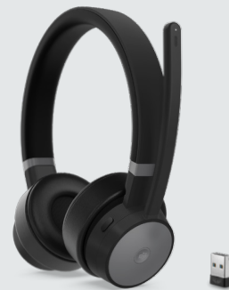
Lenovo Go Wireless ANC Headset PN: 4XD1C99222, 4XD1C99221 (w/o stand)

Designed for modern professionals, the Lenovo USB-C Universal Business Dock has everything that helps boost your productivity to the next level. With enhanced port expansion, optimum power delivery, and dual display support in a small space-saving, stylish exterior, the dock is the perfect companion for hybrid workspaces. With 11+ helpful expansion ports, optimizing your workspace and workflow has never been easier. It offers lightning-quick data transfers, dual 4K monitors, and rapid charging for notebooks up to 65W with the included adapter or up to 100W with the optional 135W adapter. It also supports one-click firmware updates even without Dock Manager.