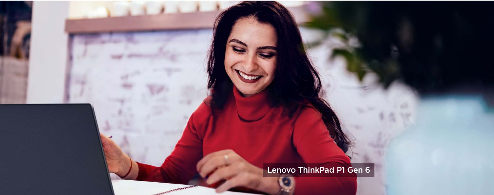
Lenovo ThinkPad P1 Gen 6

To scale and grow your SMB, you can depend on a partner that delivers best-in-class technology that's easy to integrate and easier to manage remotely.