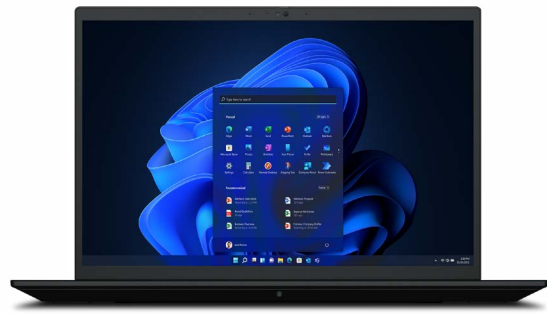
Lenovo ThinkPad P1

Remote teams need devices they can rely on to stay productive from anywhere. Flexible work environments need flexible technology that powers productivity, enhances efficiency, and stays secure no matter the location.