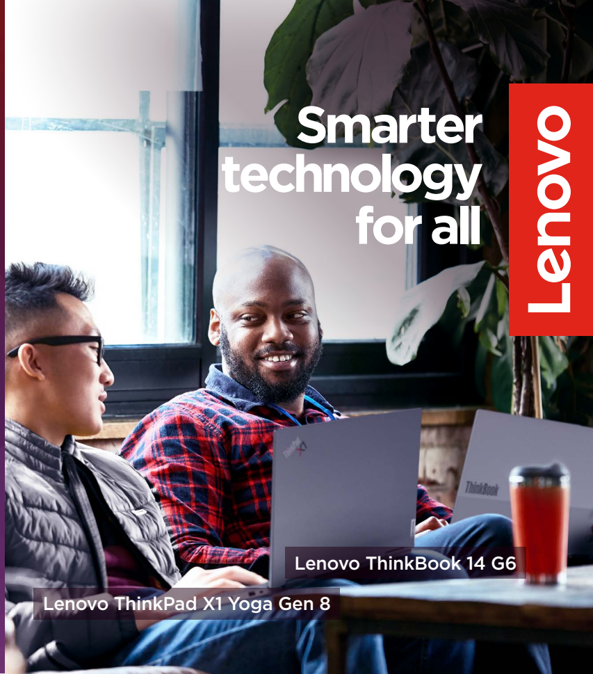
Lenovo ThinkBook 14 G6