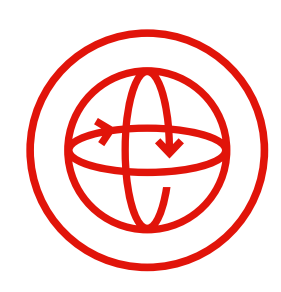
#1 selling device in K-12 globally