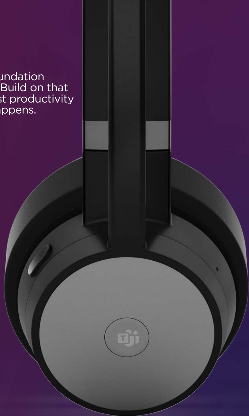
Lenovo Go Wireless Headset and Mouse

These travel-ready, field-tested peripherals are made to withstand the rigors of working from multiple locations.