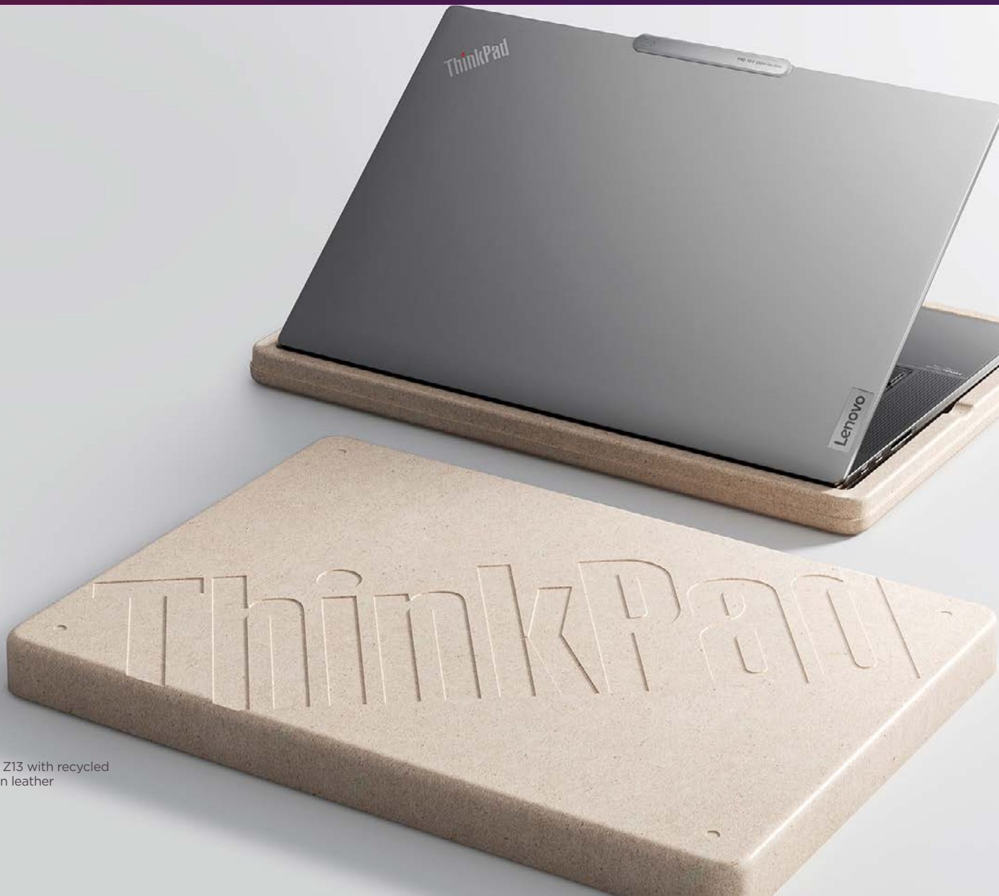
ThinkPad Z13 with recycled PET vegan leather

Hybrid workers want clear video, near bezel-less screens, and fast processing to make collaborating with team members easier. Innovation is at the heart of this generation, but it means nothing if it can't be shared.