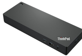
ThinkPad Universal Thunderbolt™ 4 Dock