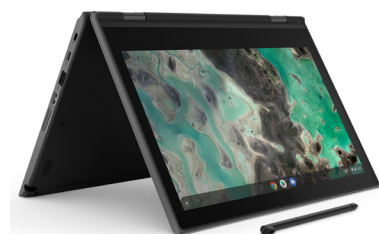
Both chromebooks, Lenovo 300e and 500e (pictured above), have a unique form factor that allow them to be used as a laptop or a tablet.