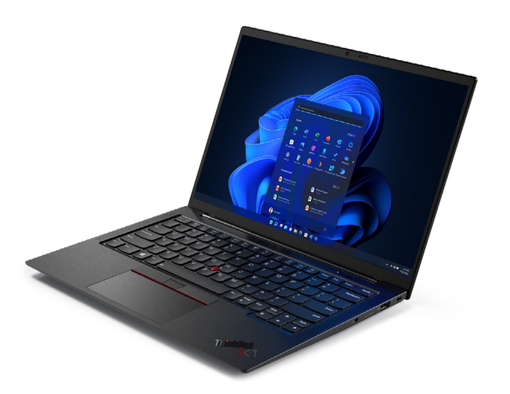
ThinkPad X1 Carbon with Intel vPro,® An Intel® Evo™ Design, is built for what IT needs and users want.

of leaders are very or "extremely concerned" about cybersecurity threats negatively impacting their organization over the next 12 months.<sup>19</sup>