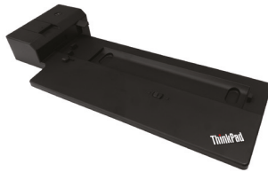
ThinkPad Pro Docking Station