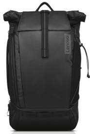
Lenovo 15.6" Commuter Backpack