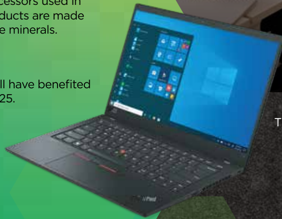
ThinkPad® X1 Carbon

Learn more about our environmental, social, and governance (ESG) efforts at www.lenovo.com/esg .