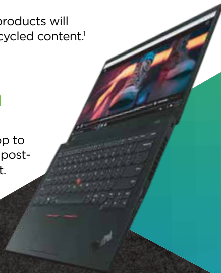
ThinkPad® X1 Carbon

Meet the first Lenovo laptop to be made with closed-loop post-consumer recycled content.