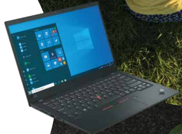
ThinkPad® X1 Carbon

We're committed to delivering energy-efficient products today and tomorrow. You'll find instant wake, and a long real-world battery life on Intel® Evo™ platform powered by Intel® Core™ vPro® processors used in Lenovo ThinkPad® laptops like the X1 Carbon. In addition, Lenovo laptops will be 30% more efficient by 2030. 2