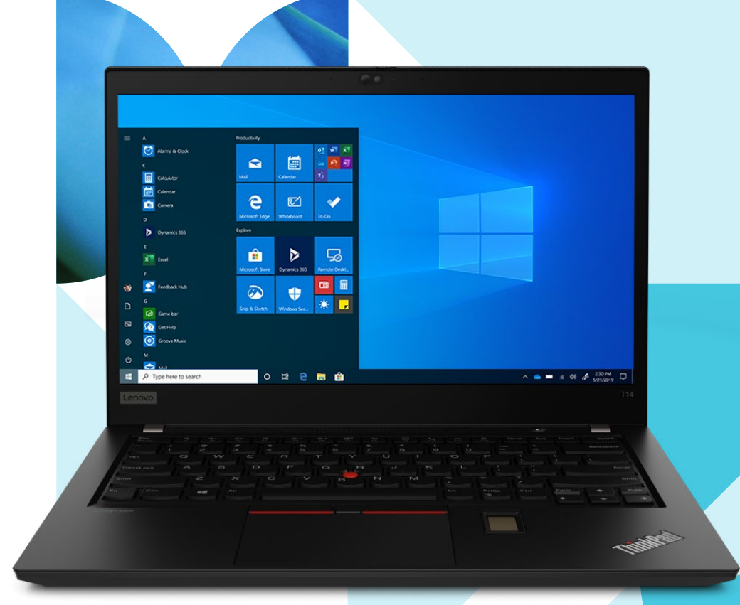
Lenovo ThinkPad T14

Lenovo Health is committed to leading healthcare technology innovation, developing products and services that solve today's healthcare challenges and prepare health systems for the future of care delivery.