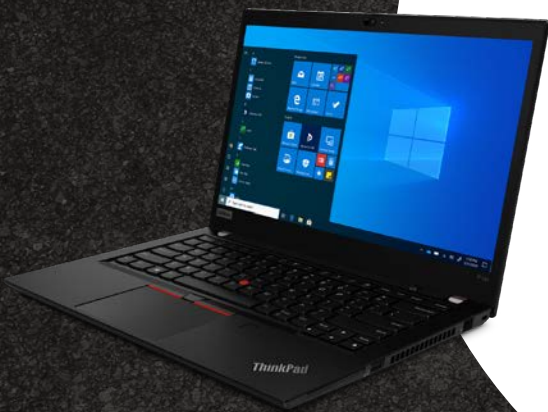
ThinkPad P14s i Mobile Workstation