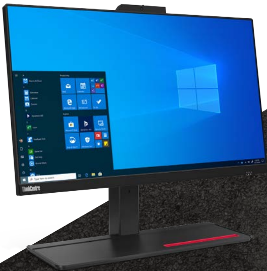
ThinkCentre M90a All-in-One

of respondents in a recent global survey indicated they were interested in a DaaS solution. 17