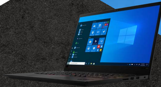
ThinkPad X1 Extreme