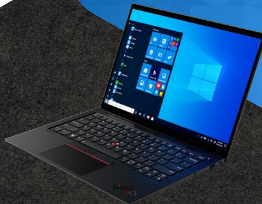
ThinkPad® X1 Carbon designed on Intel® Evo™ vPro® platform

of business leaders feel their cybersecurity risks are increasing. 7