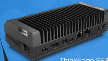
ThinkEdge SE30 designed on Intel vPro® platform

A secure gateway for protecting IoT devices against attack. All devices connected to the ThinkEdge SE30 benefit from ThinkShield protections.