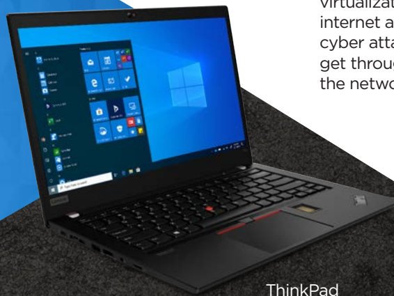
ThinkPad X13 i

Every step of the manufacturing process is controlled, audited, and tamper-proof from our facility to your employees' desks.