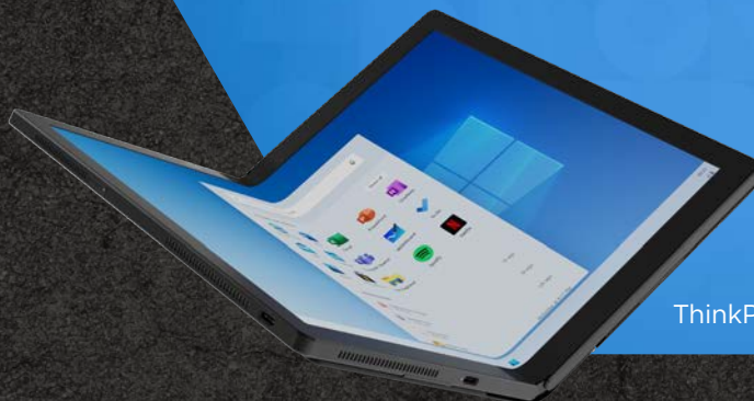
ThinkPad X1 Fold

Visit www.lenovo.com/FlexibleWorkforce and connect with a security specialist. We can help customize the right solution for your business.