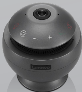
LENOVO VOIP 360 CAMERA SPEAKER PN: 40AT360CWW

Get a meeting room-like experience wherever you are, with a 360° microphone, speaker, and camera, integrated into one device. At only 90mm and weighing just 229g, this ultraportable meeting tool is ideal for mobile workers. Collaborate without distractions using its Environmental Noise Suppression (ENS) and Active Noise Cancellation technology that cuts background noise.