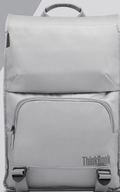
THINKBOOK URBAN BACKPACK 4X40V26080

Get a meeting room-like experience wherever you are, with a 360° microphone, speaker, and camera, integrated into one device. At only 90mm and weighing just 229g, this ultraportable meeting tool is ideal for mobile workers. Collaborate without distractions using its Environmental Noise Suppression (ENS) and Active Noise Cancellation technology that cuts background noise.