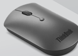
THINKBOOK BLUETOOTH SILENT MOUSE PN: 4Y50X888XX

A multi-functional backpack with anti-theft pockets ensures security on the move. The padded PC compartment offers cushioned comfort, while the high-quality fabric and stylish PU leather accent add to contemporary design.