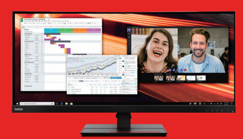
An eye - and ear - for detail

The P34w-20 kicks your work up a notch with outstanding visuals to show accurate colors from any angle. With WQHD 3440 x 1440 resolution, the monitor helps you capture even the smallest details while seeing true-to-life color with a 99% sRGB color calibration delta E<2. Designed to impress, the 2 x 3W built-in speakers offer immersive audio that is true to your ears. The P34w-20 is also created with your health and comfort in mind, with eye-care and Natural Low Blue Light technology to reduce harmful high energy blue light emissions. Adjust the monitor height up to 150 mm to suit your ideal working style or position. Meanwhile, Lenovo ThinkColour² software allows you to easily and quickly adjust your screen settings with a simple click to enhance your work efficiency and optimize your monitor's extensive capabilities. Lenovo patented features, such as LAN on ThinkColour, show the network status from the screen to facilitate a more seamless workflow.