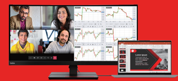
Master the art of multi-tasking

The P34w-20 kicks your work up a notch with outstanding visuals to show accurate colors from any angle. With WQHD 3440 x 1440 resolution, the monitor helps you capture even the smallest details while seeing true-to-life color with a 99% sRGB color calibration delta E<2. Designed to impress, the 2 x 3W built-in speakers offer immersive audio that is true to your ears. The P34w-20 is also created with your health and comfort in mind, with eye-care and Natural Low Blue Light technology to reduce harmful high energy blue light emissions. Adjust the monitor height up to 150 mm to suit your ideal working style or position. Meanwhile, Lenovo ThinkColour² software allows you to easily and quickly adjust your screen settings with a simple click to enhance your work efficiency and optimize your monitor's extensive capabilities. Lenovo patented features, such as LAN on ThinkColour, show the network status from the screen to facilitate a more seamless workflow.