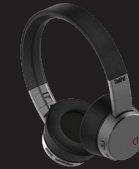
X1 ANC Bluetooth Headphones

The Lenovo USB-C 7-in-1 Hub charges devices while providing an easier, faster way for employees to connect and disconnect peripherals.