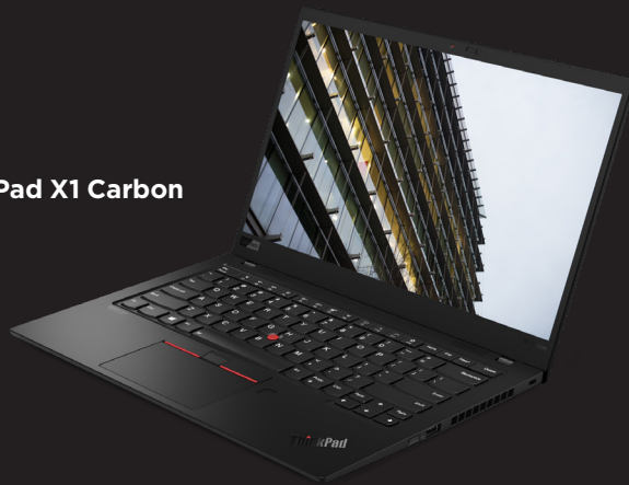
ThinkPad X1 Carbon

Dual far field mics, Dolby® Audio™ Speakers, and optional 4K Dolby® Vision™ HDR displays ensure that video-conferences look and sound exceptional. And all of these devices are backed by Lenovo Premier Support, which means help is just a phone call away.