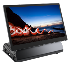
inTOUCH156 15.6" display

These monitors are flexible, durable, and as practical as they are beautiful. Responsive and easy to use, they engage customers with brilliant displays while providing the latest antimicrobial surface technology to minimize microbial growth on the surface of the display.*